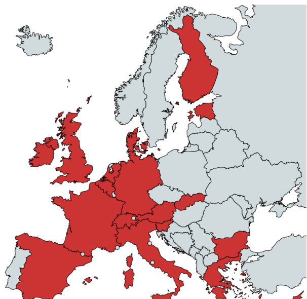
FIGURE 2 MAPPED COUNTRIES

Additionally, during the closing mentorship feedback and masterplan development sessions, Innovators were asked to confirm their current