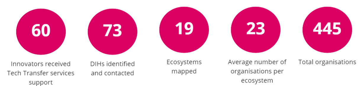
FIGURE 3 OVERVIEW OF THE TECH TRANSFER SERVICES MAPPING

Tech-transfer service activities covered in this report were performed from M1 to M36. As the Task description was updated after noticing a very low response rate from the Digital Innovation Hubs and a lack of interest from those that did respond, the scope of the Task has been expanded and more organisations were mapped in order to provide a broader overview to the Innovators of what resources are readily available and what are the organisations working with the start-ups and scale-ups and offering support. Additionally, feedback on what ecosystem maps are needed was collected from the Innovators themselves. Mentors also supported task coordinators in the mapping process by providing their ideas on relevant organisations start-ups/scale-ups should reach out to. Total figures: